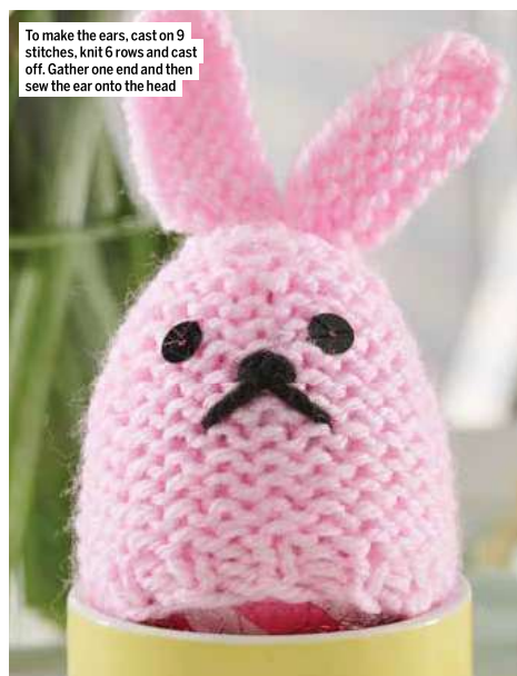
To make the ears, cast on 9 stitches, knit 6 rows and cast off. Gather one end and then sew the ear onto the head