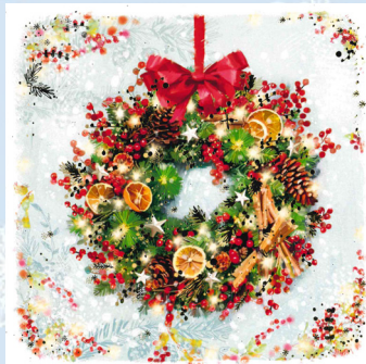
CHRISTMAS WREATH WITH ORANGES