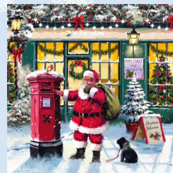
LAST MINUTE POST