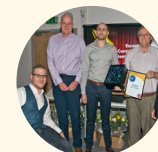
The Team Award IMT Team