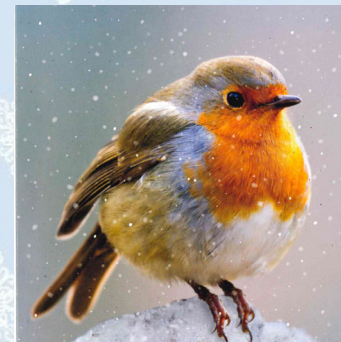
ROBIN AT WINTER TIME