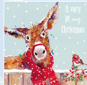
DONKEY AT THE FENCE